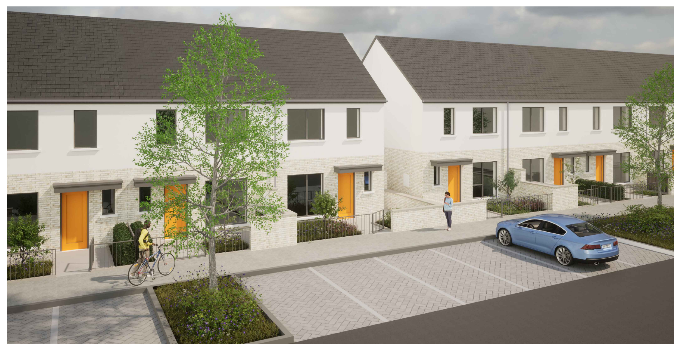
Image of typical curtilage treatment to 2-bed House Type A