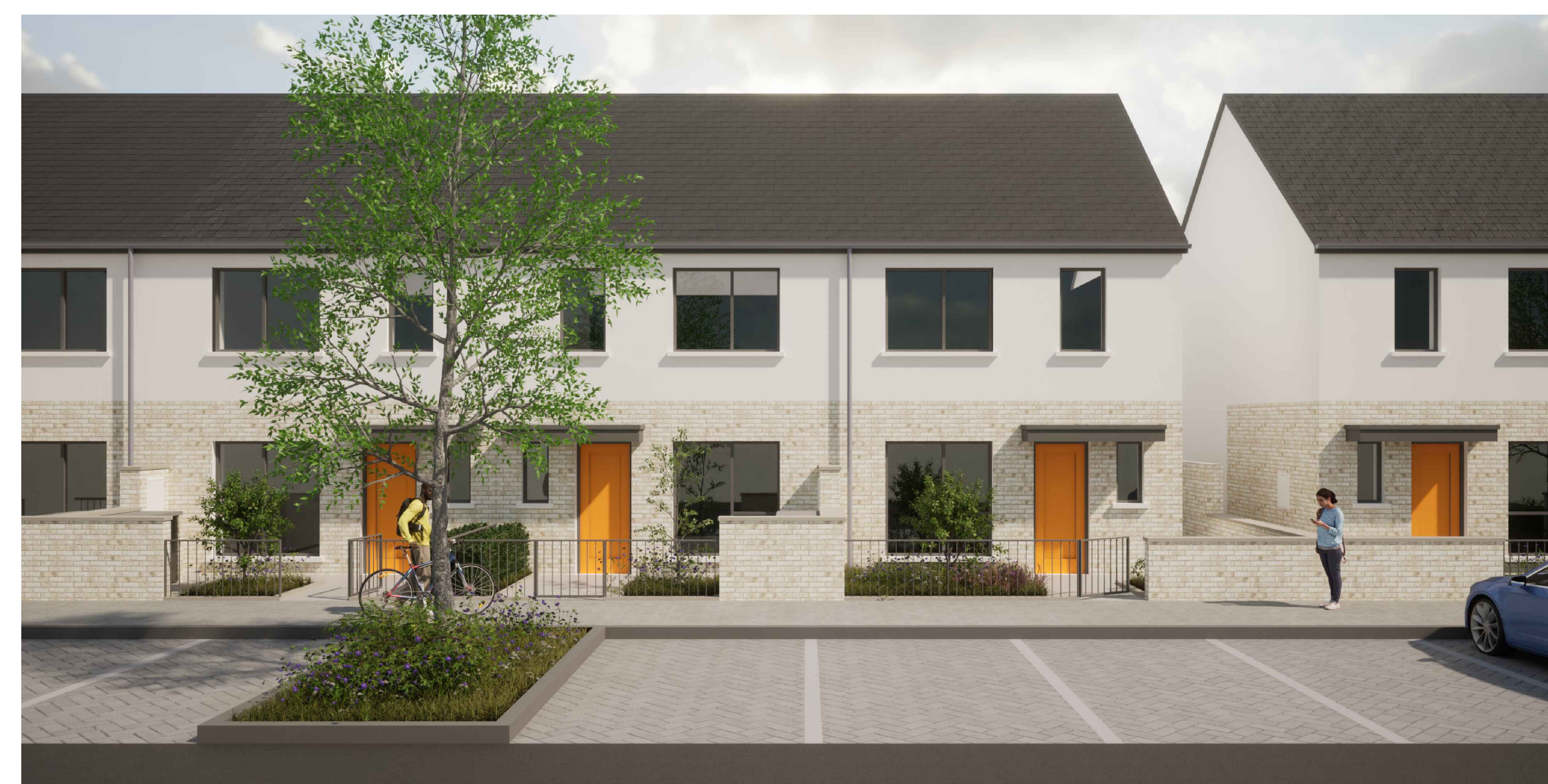
Image of typical curtilage treatment to 2-bed House Type A